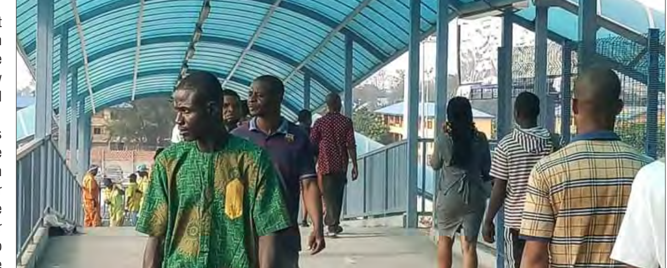
Mile 2 pedestrian bridges

In recent times, commuters have been urging the government to open pedestrian bridges as schools resume for new term, especially for the pupils of Amuwo-Odofin senior high school to have access to the bridge than crossing the highway to avoid accidents.