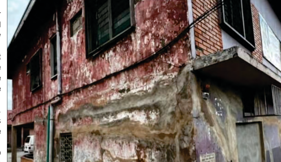
The distressed building in Ebute-Meta

"This underlies our resolution to act promptly in addressing the spate of building collapse by removing uninhabitable structures before they cause more havoc, especially during the rainy season when such buildings are