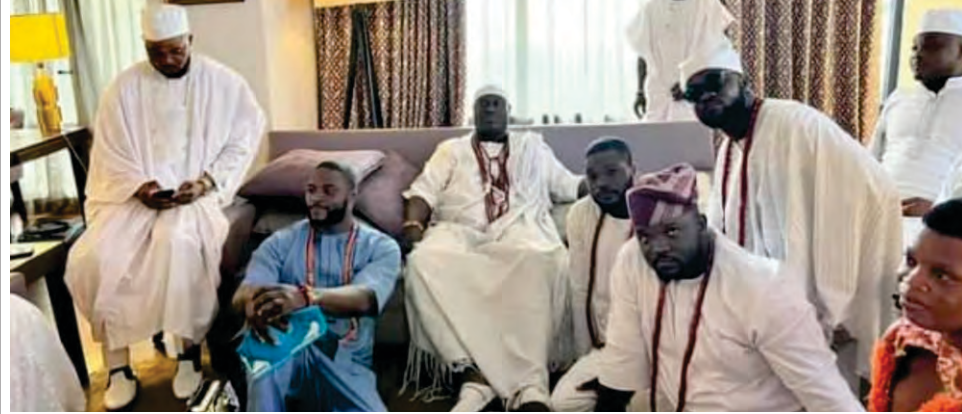
Elebo Royal family with Ooni of Ife in photograph

However, reports disclosed that on Oworo Obaship tussle, Court declined the request to lift the injunction and adjourned the case till July 7, 2022.