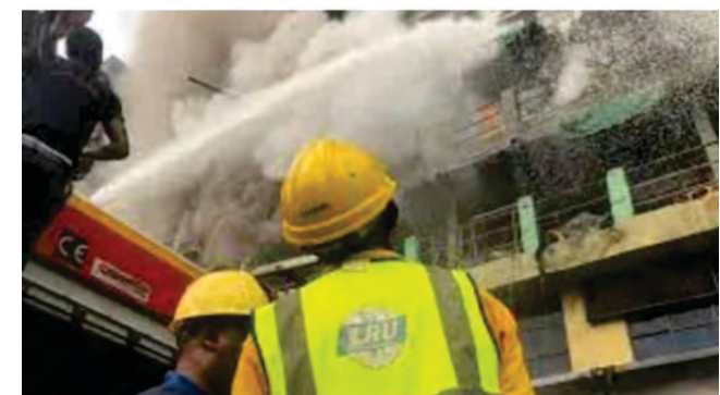
Old building in Somolu

It would be recalled that in the last few days, two buildings had