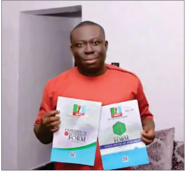
Hon. Abiodun Owokoya

"I urge you all to come out and vote for me during our party primary election so that I can be the APC flag bearer in the House of Representatives election slated for May 19, 2022."