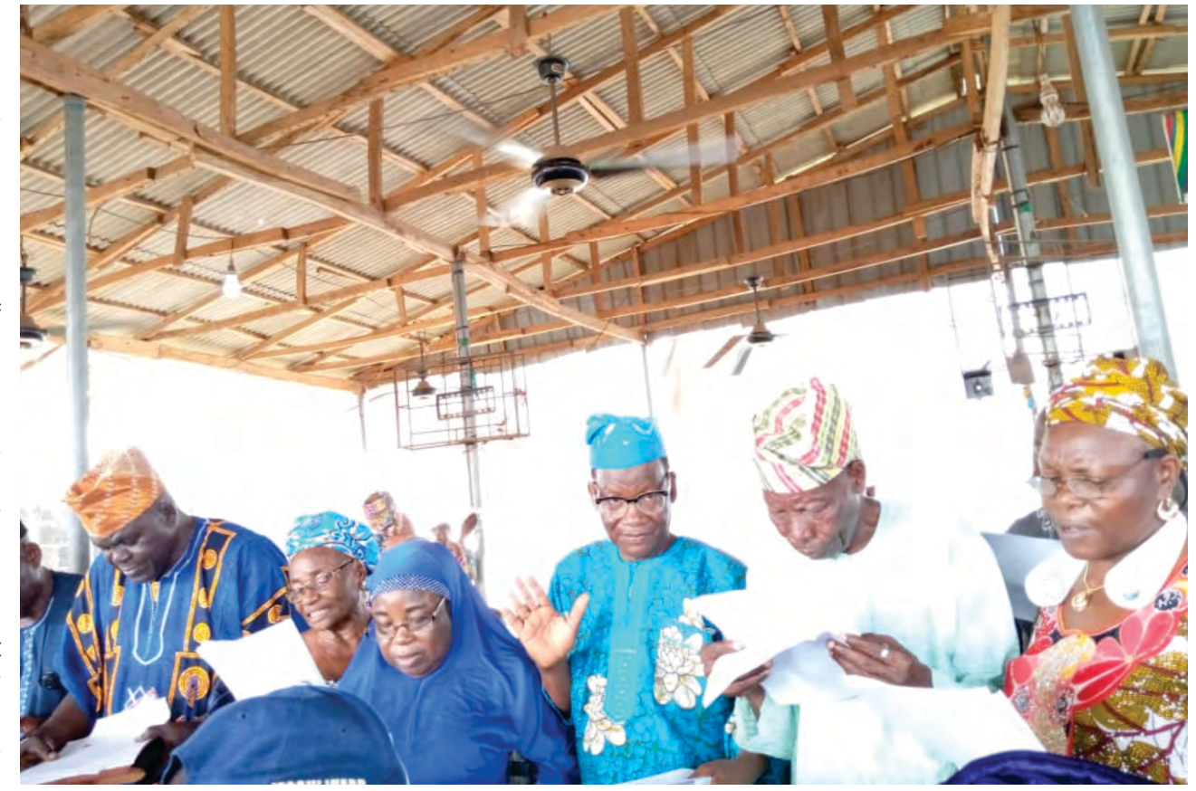
The inauguration exercise

be prepared to defend the party regardless of their personal interest as the oath guarantees the party that all officials are